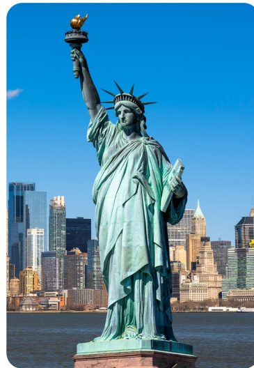
Statue of Liberty (Liberty Enlightening the World)

A statue is a three-dimensional representation of a person, animal or mythical being. It is usually the same size as the person or animal in real life or much larger. Most statues are displayed outdoors, so artists make them from durable materials, including stone or metal, such as marble or bronze.