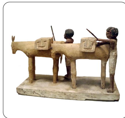
Ancient Egyptian figurines

The making of statues, statuettes and figurines is an ancient craft. It was an important part of the culture of past civilisations, including ancient Sumer, ancient Egypt and the Indus Valley. The sculptures made by these civilisations include important people, such as monarchs and religious deities. They also tell us about the everyday lives of the people who were part of these ancient civilisations and the things that were important to them.