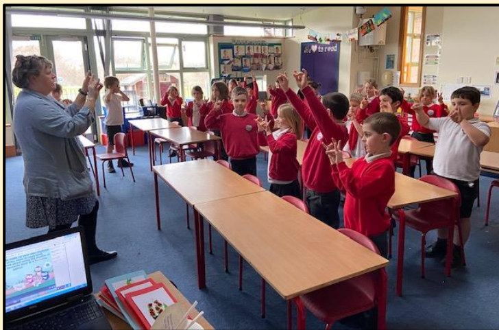
Learning sign language to a song in Music