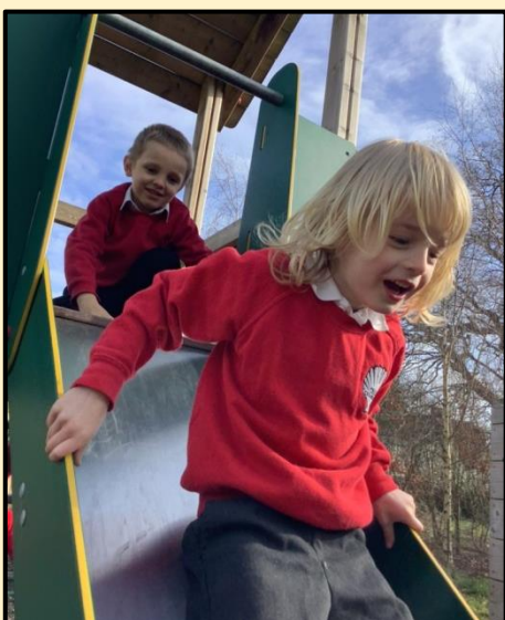
Having a great time on the adventure playground!