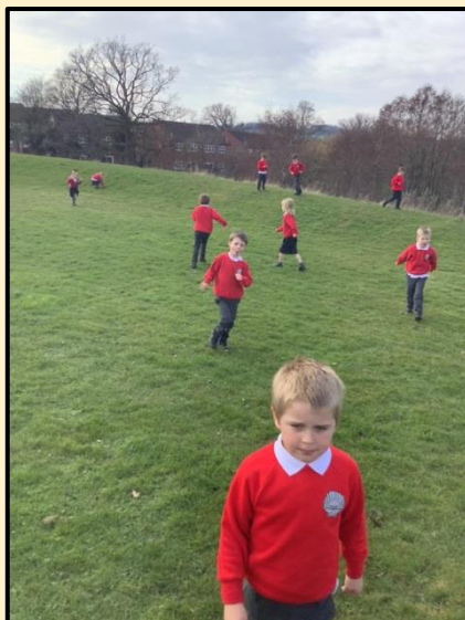
Enjoying the fresh air with a run around the field