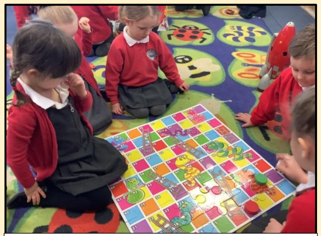
Joining in with some Maths games