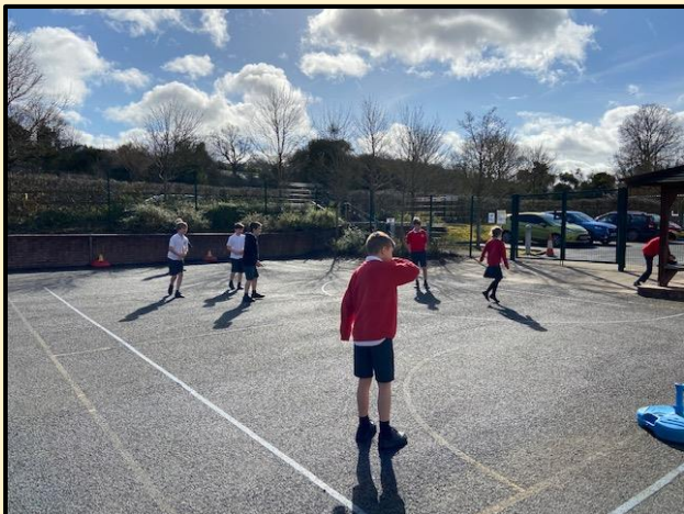
KS2 playing football in the sunshine