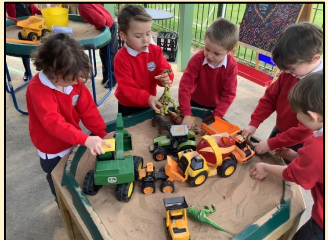
Enjoying opportunities to play with our friends