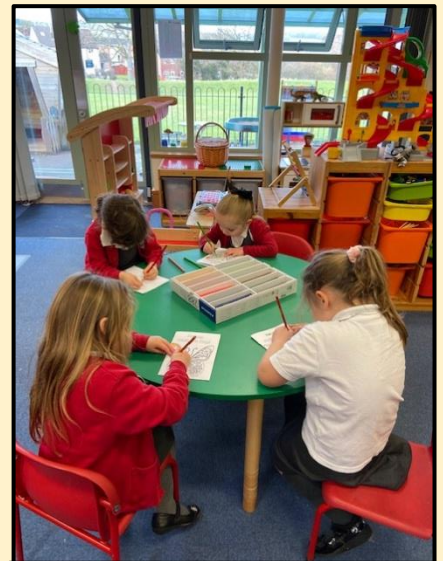
Making Mother's Day cards