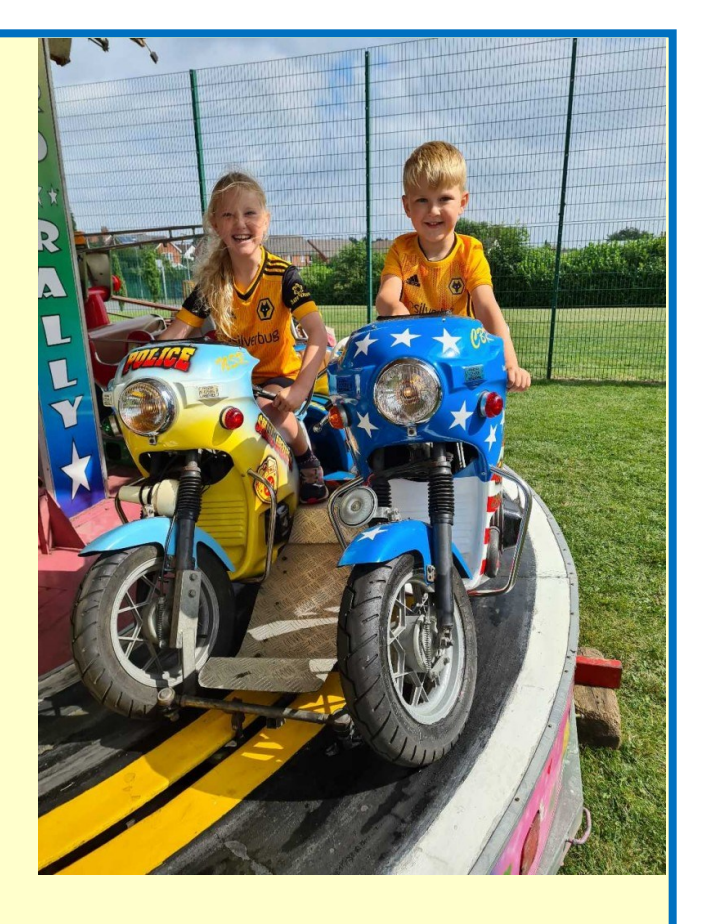
The children looked like they had a fabulous time during the summer holidays!