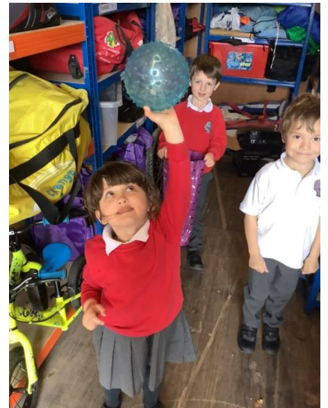
Class 1 looking for 3d shapes around the school grounds