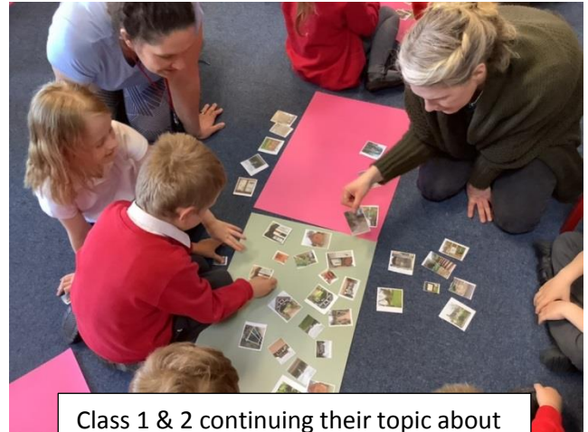
Class 1 & 2 continuing their topic about 'Cradley past and present'