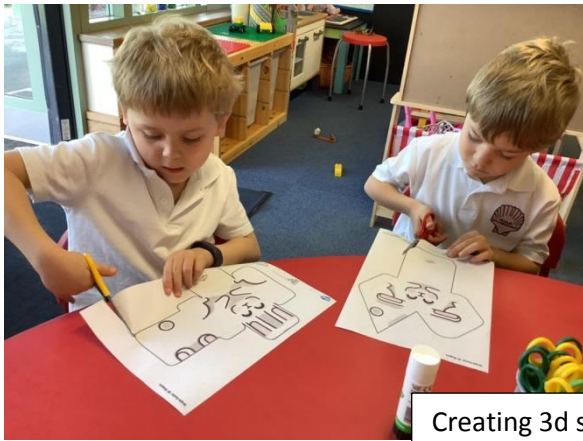
Creating 3d shapes