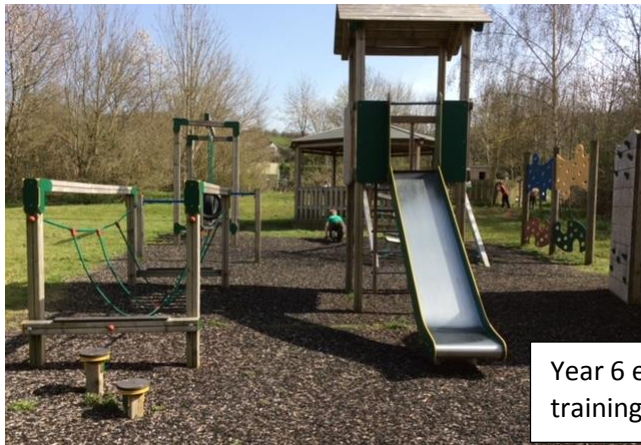
Year 6 enjoying some cadet style training in Forest School