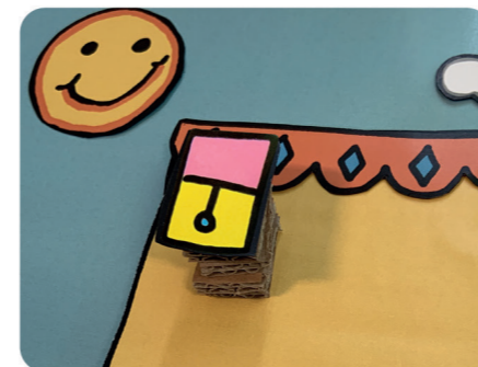
Five layers of cardboard make this window stand out.

Layers of corrugated cardboard can be glued to the back of cut outs to create a 3-D effect.