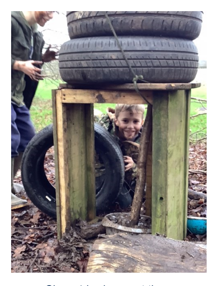
Class 4 had a great time this week in Forest School they built dens and enjoyed the mud!