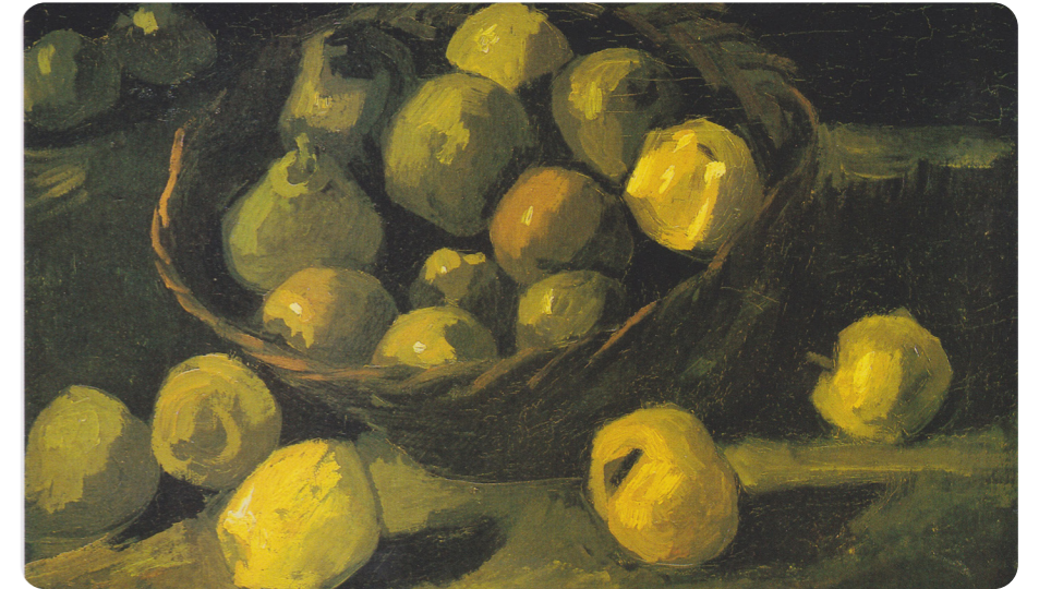
Still Life with Basket of Apples by Vincent van Gogh, 1885

Tints and shades are used in paintings to create light and shadow. This painting by Vincent van Gogh is a good example of the use of tints and shades. The apples in the foreground are painted in tints of green to emphasise light. The apples in the background are painted in shades of green to show that they are in the shadows.