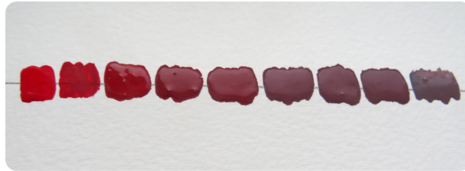
tones of red

A tone is a colour mixed with grey. Tones are less vibrant than the original colour. Using a tonal colour in a painting balances other intense colours and bright hues. When mixing a tone, begin with the pure colour and add grey paint a tiny bit at a time.